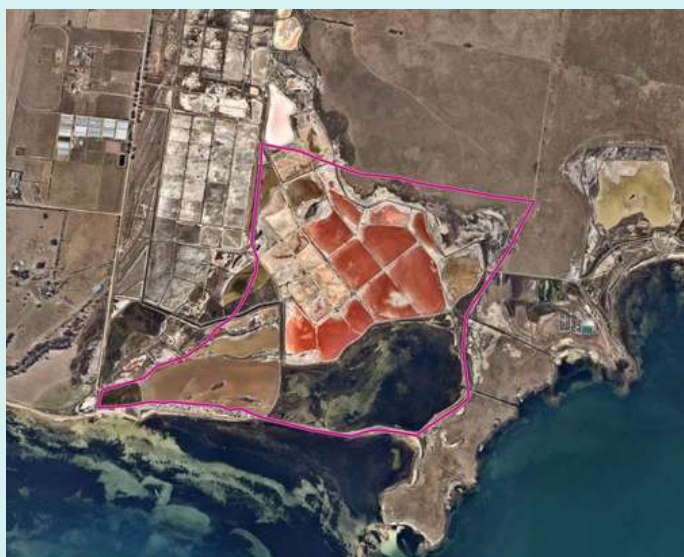
Avalon Coastal Reserve (225 ha)