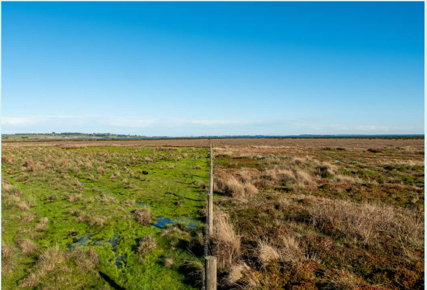
Program 2 on-ground works site in Western Port. At this site Thierry Rolland from Parks Victoria will be fencing grazed saltmarsh on private land. The power of the fence can be seen in the photo with grazed land on left and protected saltmarsh on right.