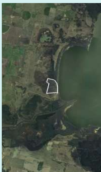
Lake Wellington, Sale (90 ha)