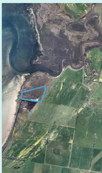
Western Port, Bass River (10 ha)