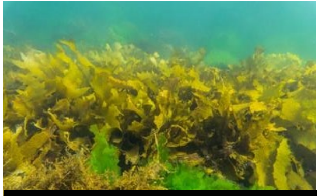
Golden Kelp forest and macroalgae at Jawbone Marine Sanctuary

Kelp forests are formed when species such as Golden Kelp ( Ecklonia radiata ) and Giant Kelp ( Macrocystis pyrifera ) form a canopy alongside other macroalgae. Golden Kelp forests can be found along the entire Great Southern Reef, which covers 8,000km of Australia's coastline, while Giant Kelp is predominantly limited to southeast Australia. Kelp forests dominated by Golden Kelp have experienced significant declines in Port Phillip Bay over the past few decades.