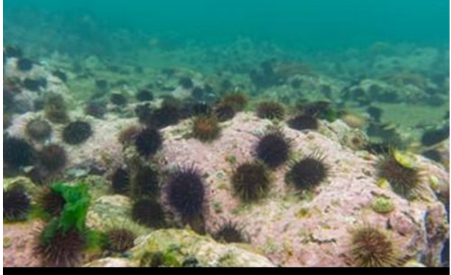
An urchin barren in Port Phillip Bay

Urchin densities of around 2/m^2 are considered desirable for a healthy macroalgal system [2], but in some parts of Port Phillip Bay, urchin densities are as high as 60/m^2 [3] with more than 100 million urchins estimated to be in the bay and at least 60% of the reefs in Port Phillip Bay now impacted by urchin overgrazing [4].